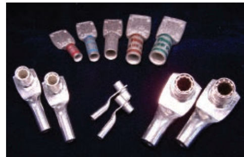
Industry Standard Color Coding

Notice: Specifications are subject to change without notice. Contact your nearest Amphenol Corporation Sales Office for the latest specifications. All statements, information and data given herein are believed to be accurate and reliable but are presented without guarantee, warranty, or responsibility of any kind, expressed or implied. Statements of suggestions concerning possible use of our products are made without representation or warranty that any such use is free of patent infringement and are not recommendations to infringe any patent. The user should assume that all safety measures are indicated or that other measures may not be required. Specifications are typical and may not apply to all connectors.