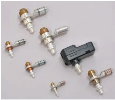
4 Sizes, 7 Ampacities

Ideal markets include Medical and Test Equipment, Process Control, Heavy Equipment and Rail. Any applications that use high current, frequently plugged & unplugged cables or a “plug and play” setup would be an ideal “fit” for the SurLok.